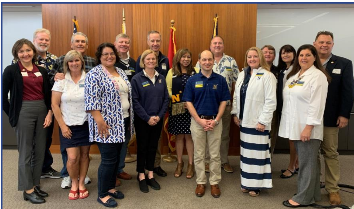
2019—2020 APCSC Board