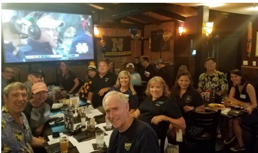
Navy vs. Notre Dame viewing party